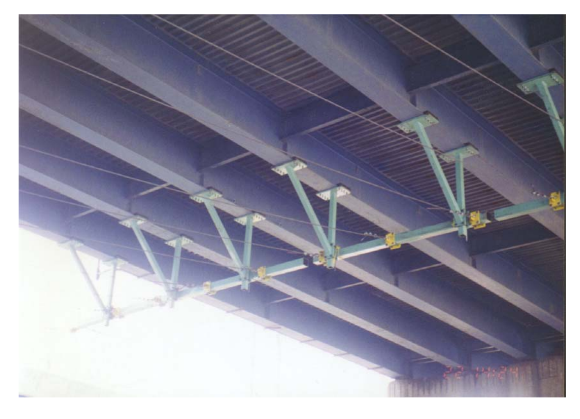
Post Bracket/Horizontal Support Tube End Connection Assembly